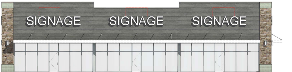
BUILDING D EXTERIOR ELEVATION