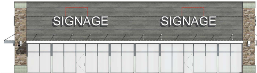
BUILDING F EXTERIOR ELEVATION