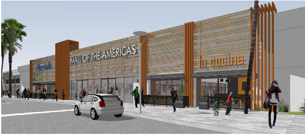
Proposed Main Entrance Renovations