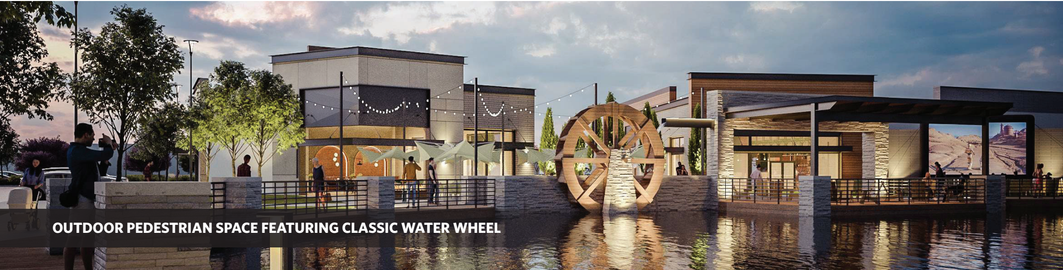
OUTDOOR PEDESTRIAN SPACE FEATURING CLASSIC WATER WHEEL