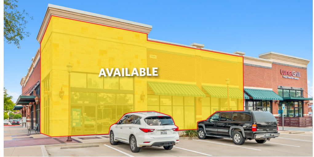
UNIT 5505-120 | 4,114 SF RETAIL SPACE AVAILABLE