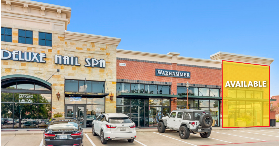
UNIT 5505-230 | 2,000 SF RETAIL SPACE AVAILABLE